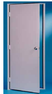
3'x7' Heavy Duty Commercial Door

Heavy duty double sliding doors, sealed at top, bottom and sides